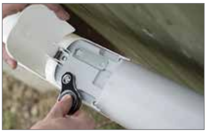
Possibility to unlock motor with transmitter