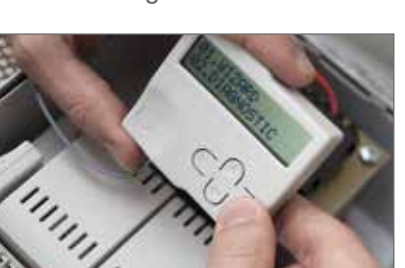
DYL handheld programmer with display for easy programming